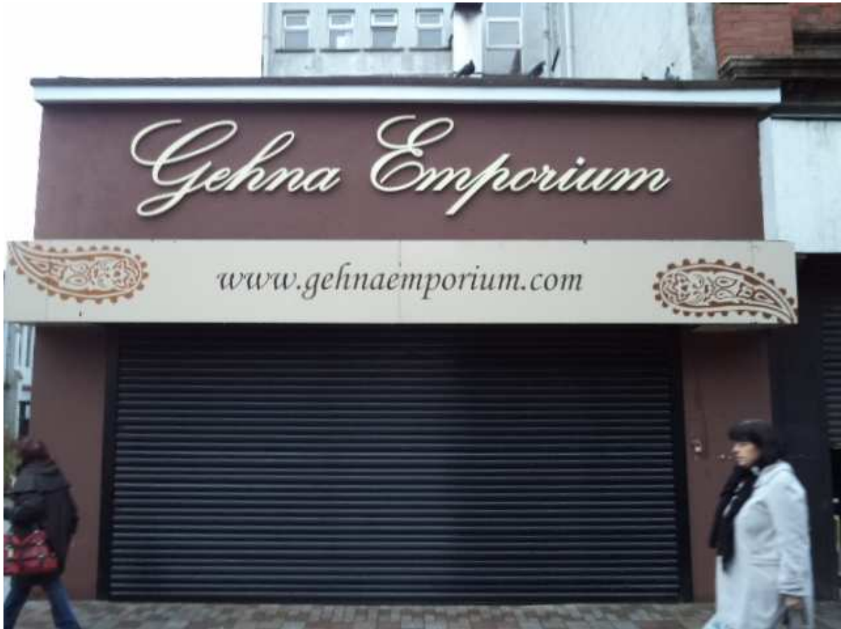
FRONT ELEVATION WORKS COMPLETED